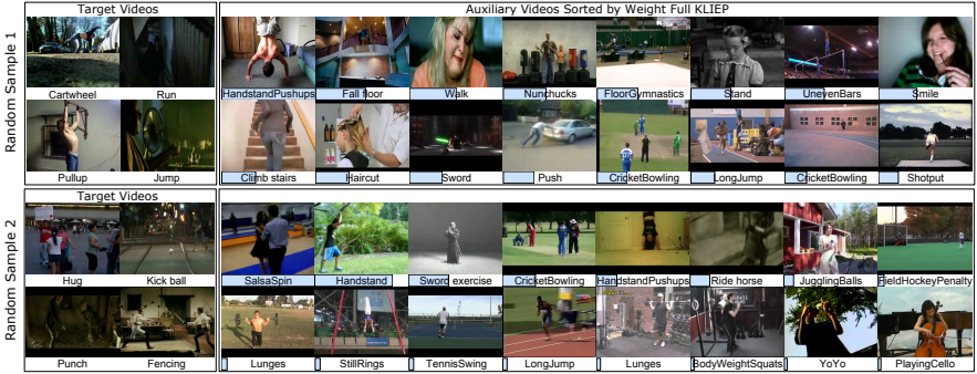
Fig. 2. Visualisation of Full KLIEP auxiliary data weighting. Left: 4 target videos with category names. Right: 16 auxiliary videos with bars indicating the estimated weights.